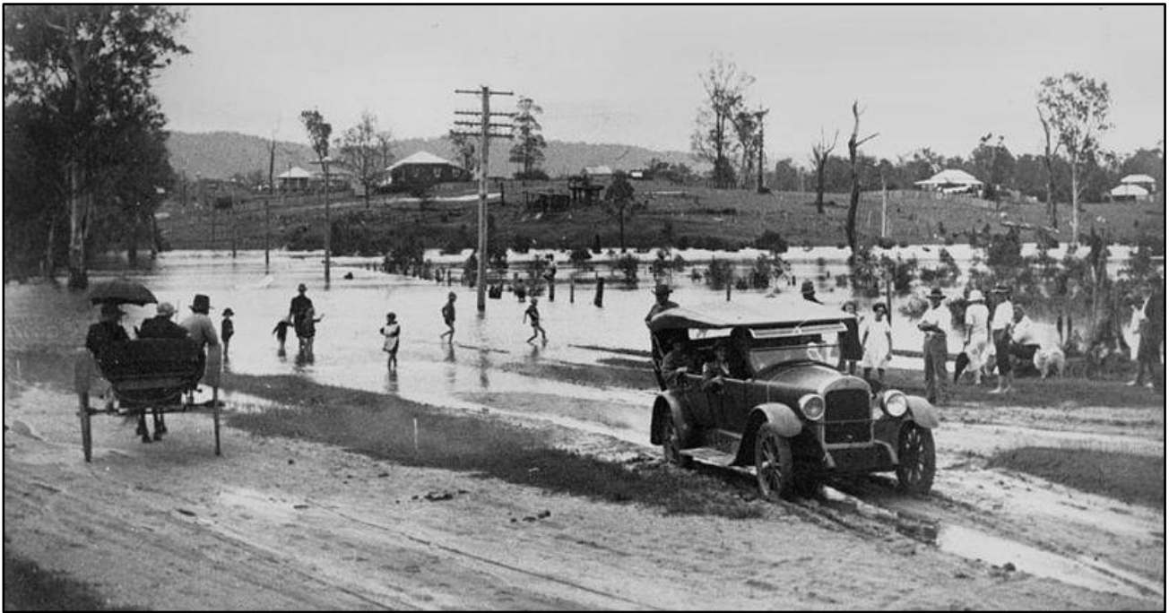
A 1924 Velie series 58 has just successfully crossed Stony Creek during the 1930 Woodford floods.