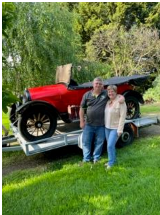
The York's New Acquisition